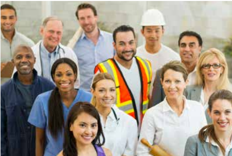
Getting a Job